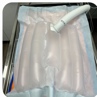
Chill Buster & Bair Warming System